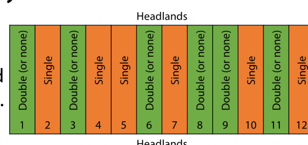
Figure 1. An example of a replicated and randomized on-farm inoculant trial layout with two treatments.