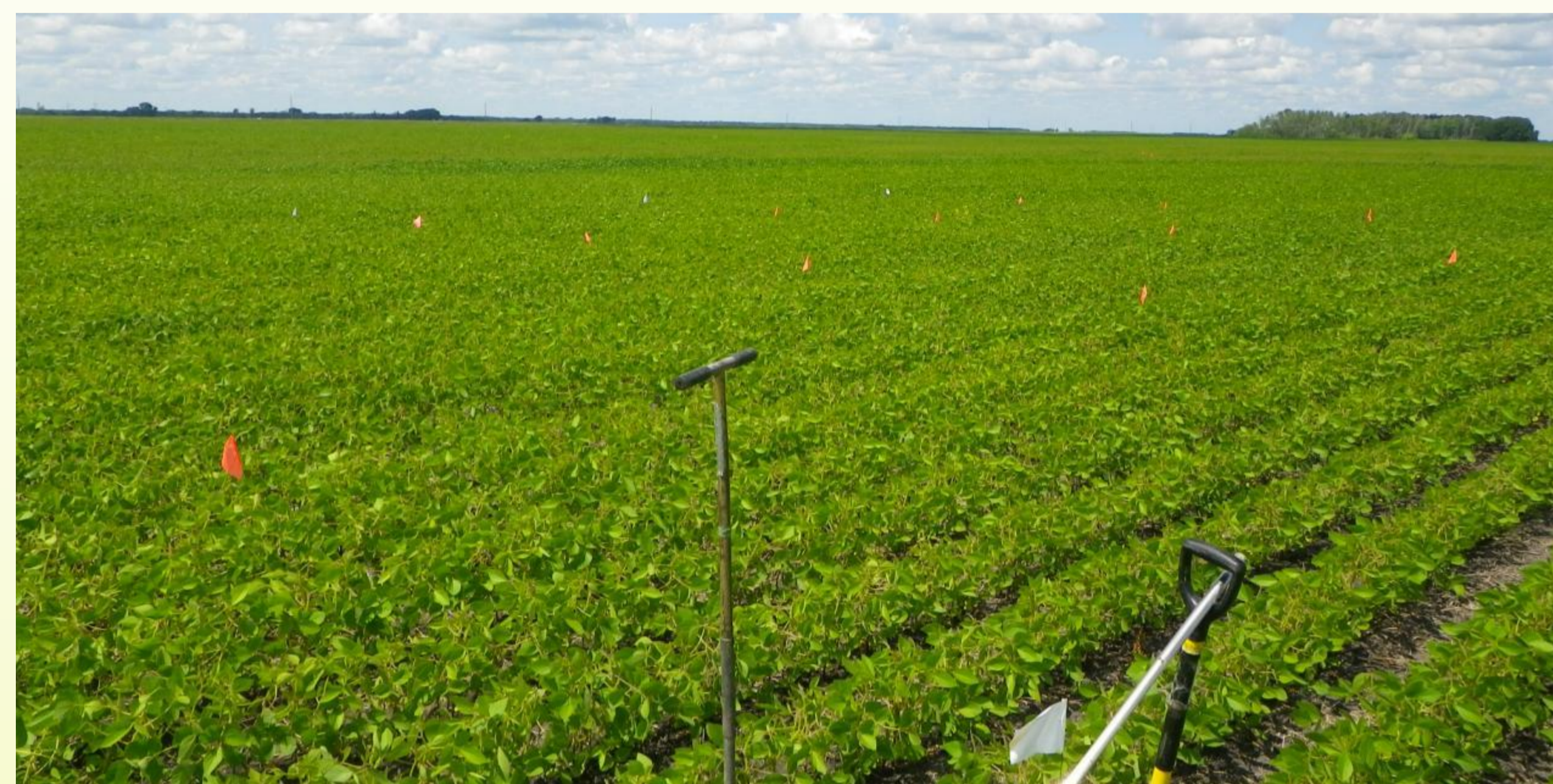
Figure 1. Lettelier plot area with narrow strip of better nodulated soybeans in background on higher ground.

Fields near Lettelier, Holland and Roseisle were identified in late July due to reduced growth and yellow colour (Figures 1-3)