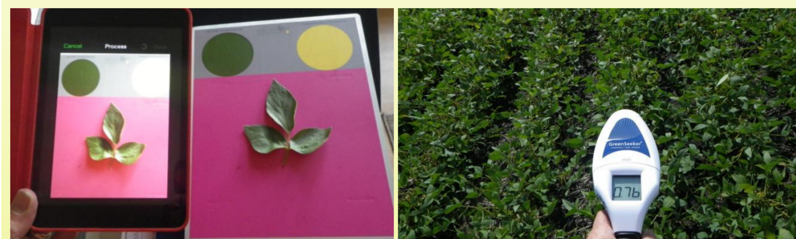
Figure 4. Using the FIELDSCOUT Greenindex to determine leaf colour.

Severity of nitrogen deficiency was measured several ways (Table 2) including a Smartphone app for chlorophyll content (Figure 4) and pocket GreenSeeker for biomass or NDVI (Figure 5).