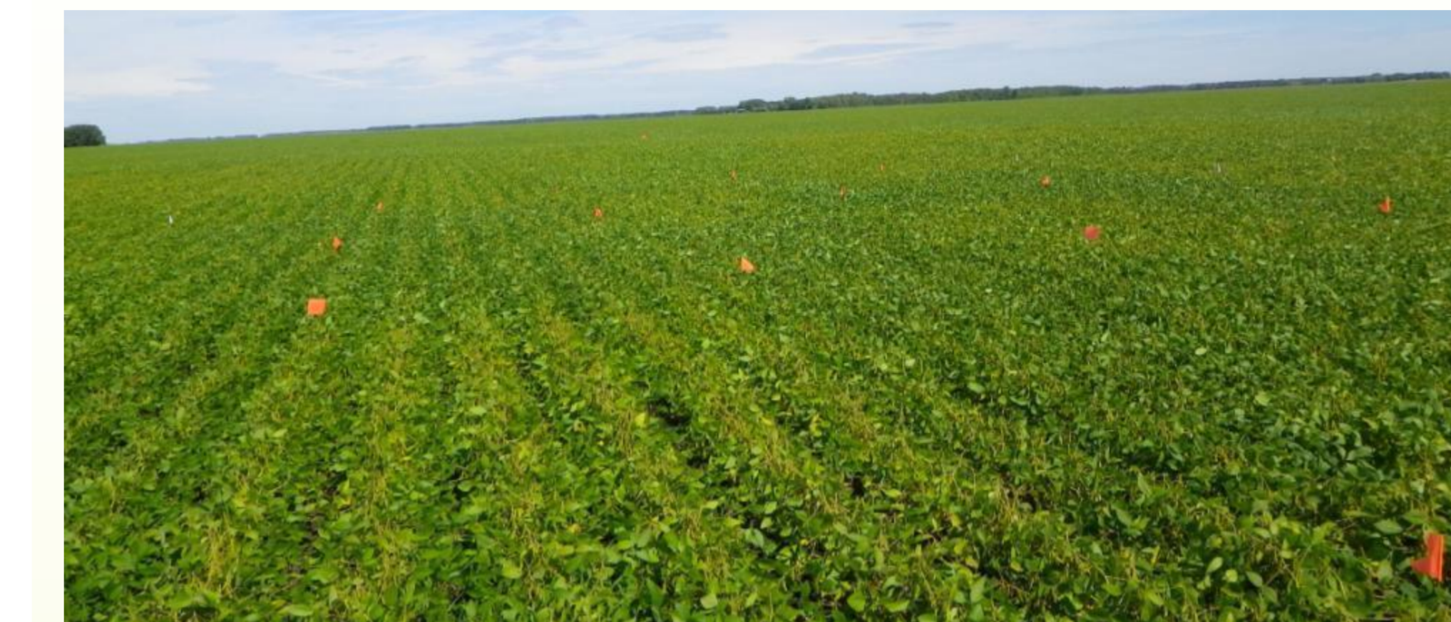
Figure 6. Colour and growth differences in Letellier plots in early September..

Treatments were replicated 3-4 times in a RCBD.