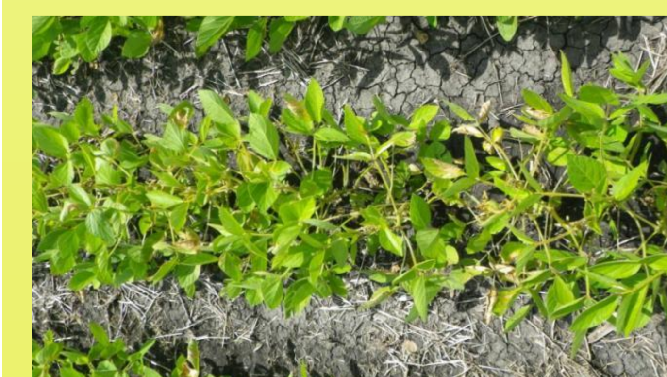
The grower at Letellier applied dribbled UAN @ 50 lb N/ac prior to our visit which caused obvious leaf burn, especially in overlapped areas (Figure 5).