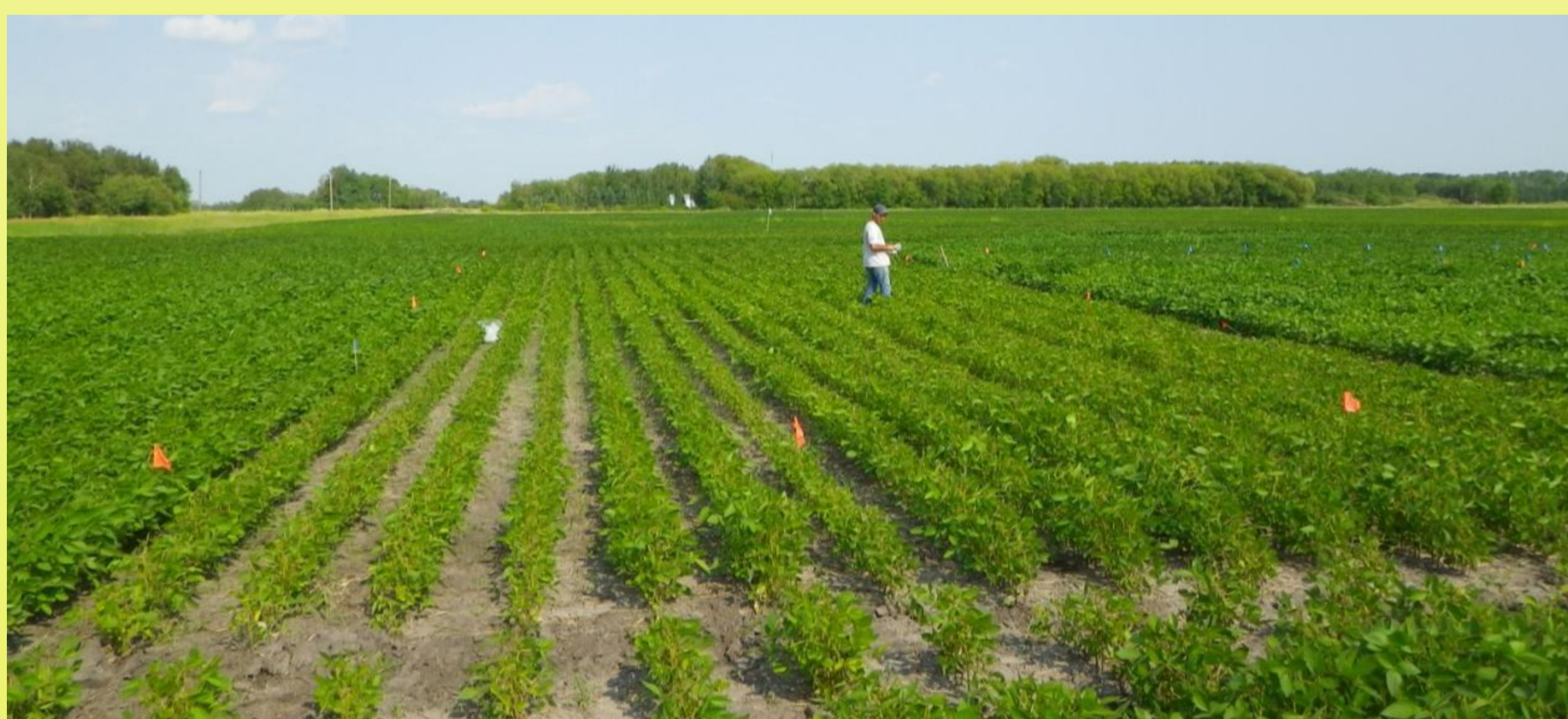
Figure 3. Roseisle site.