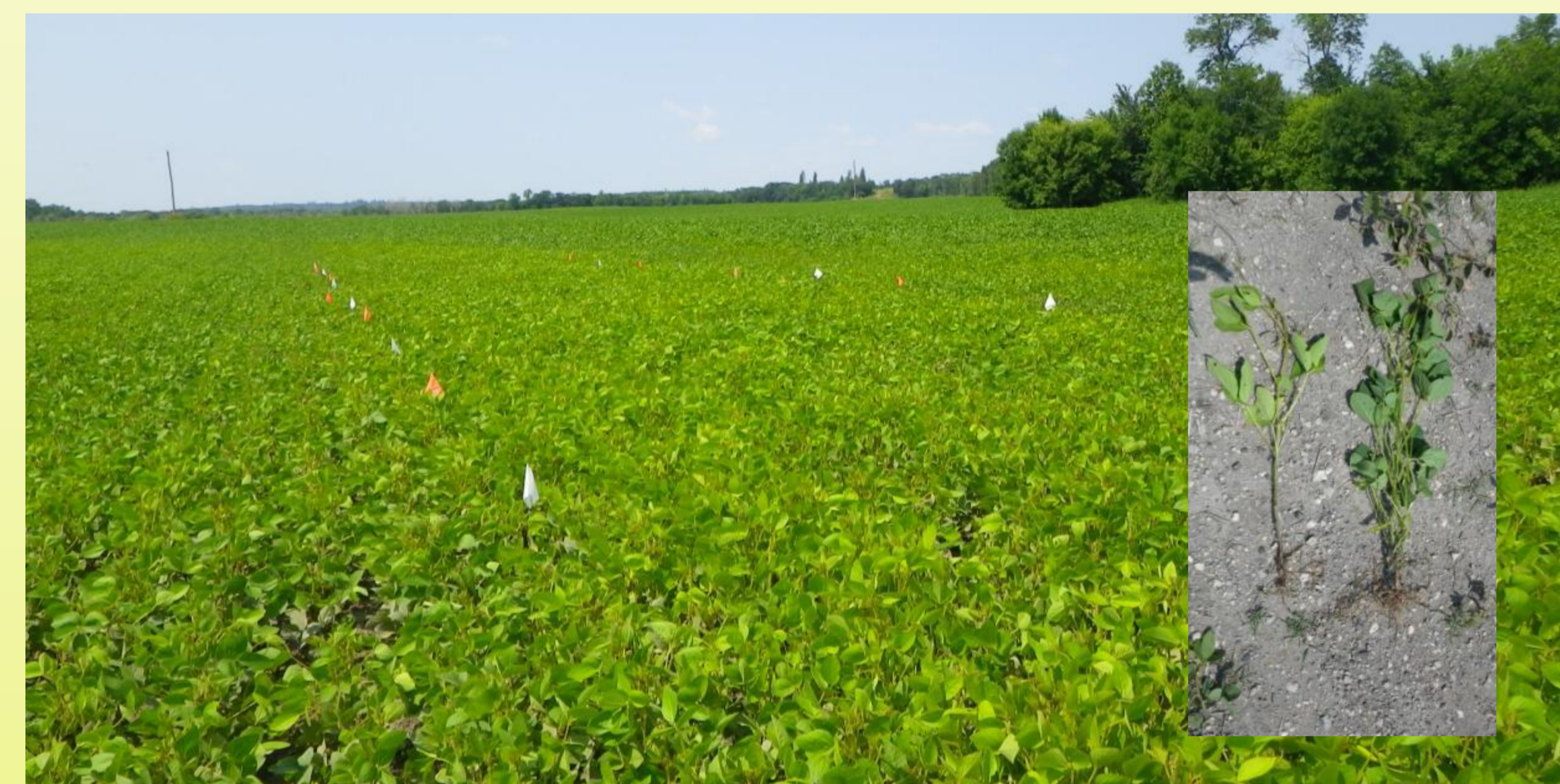
Figure 2. Holland site with flooded soybean plot area in foreground and unflooded soybeans upslope. (inset of plant comparison)