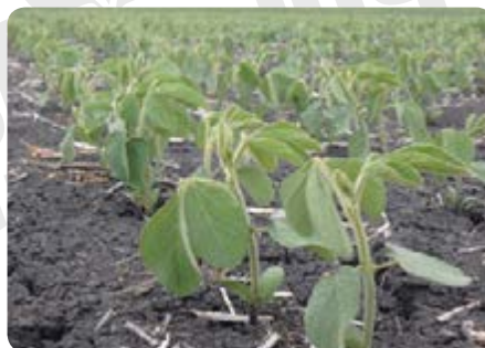
▼ Figure 1. Drought-stressed soybean plants with bowed stems and wilted leaves at the 2nd trifoliolate (V2) stage on June 13, 2017.

Chemicals degrade in the soil by two primary mechanisms: microbial and chemical hydrolysis. Herbicides that require microbes to break down (e.g., clopyralid) also require warm temperatures and soil moisture. Under dry conditions, these chemicals may not break down properly. Therefore, it is recommended to examine field records, environmental conditions and other contributing factors (e.g., soil pH) when planning your rotation this winter. Soybeans are not the only crop susceptible to herbicide carryover.