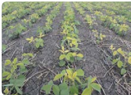
▼ Figure 2. Soybean plants exhibiting symptoms of IDC at the second trifoliolate stage on June 19, 2017.